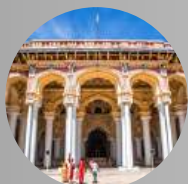
Thirumalai Nayakkar Mahal