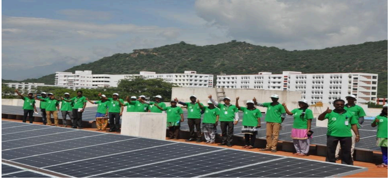
Our Green Army Volunteers monitoring the Solar Power Plant on 26.03.2024