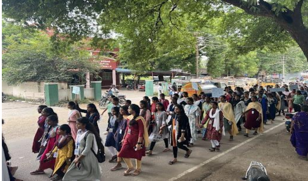
Around 300 volunteers participated in the event and they raised their voice as “Healthy soil, healthy planet!”, “Protect soil, nurture life!”, “Preserve soil, preserve life!” and “Nourish soil, nourish future!”- Environment monitoring Club on 16.12.2023