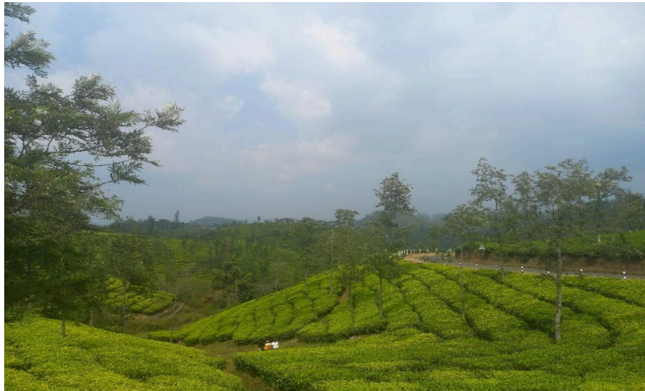
The journey was a captivating blend of learning, exploration, and creative expression- Horticulture Club on 24-02-2023