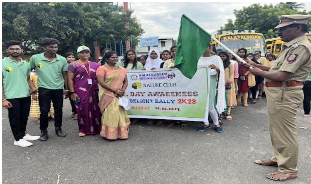
Our Nature Club took a moment to celebrate the same on 16th December 2023. An awareness rally was conducted by Nature Club, KARE at Watrap- Nature Club on 16.12.2023