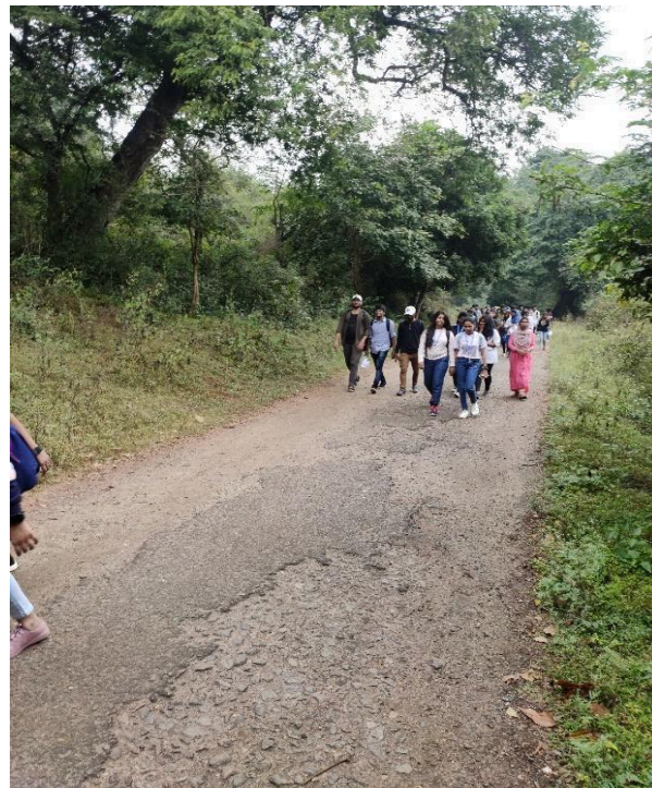
Inspection survey and analysis of energy- Energy Audit Club on 23.03.2024