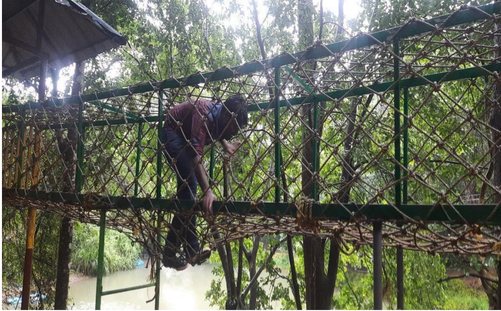
Engaged in adventurous activities & gardening- Agriculture Club on 23.03.2024