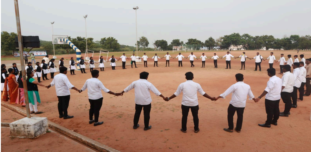
Awareness Program: Create a brighter & cleaner world on 12.12.2023