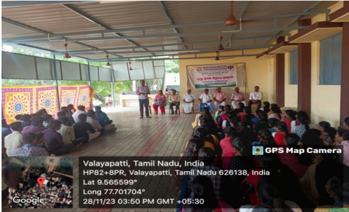
Seven days Special Camp