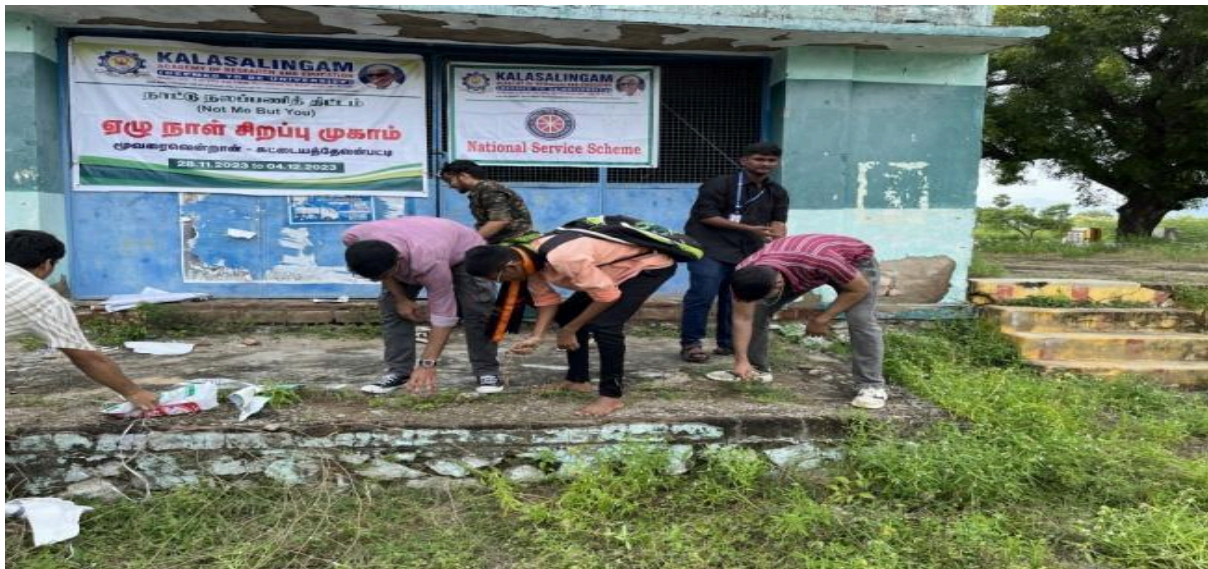
Unnat Bharat Abhiyan Clean India Campaign

Our students also participated in the nationwide initiation Unnat Bharat Abhiyan Clean India Campaign. Nearly 500 students participated in this cleaning camp and educated the rural area people to maintain the hygiene, sanitation and proper disposal of waste.