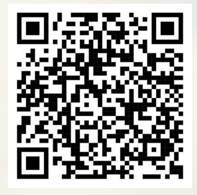
Scan to Register

IFSC Code: UBIN0562734 Swift Code: UBININBBKCH