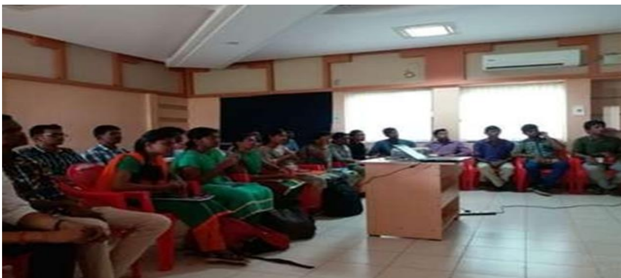
English Enrich Programme Jan 24, 2023

Enabled India Academy conducted one day workshop for physically disabled students in the topic " English Enrich Programme" Every year