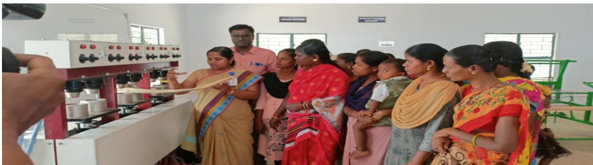
Cup making Program – 18/08/2022