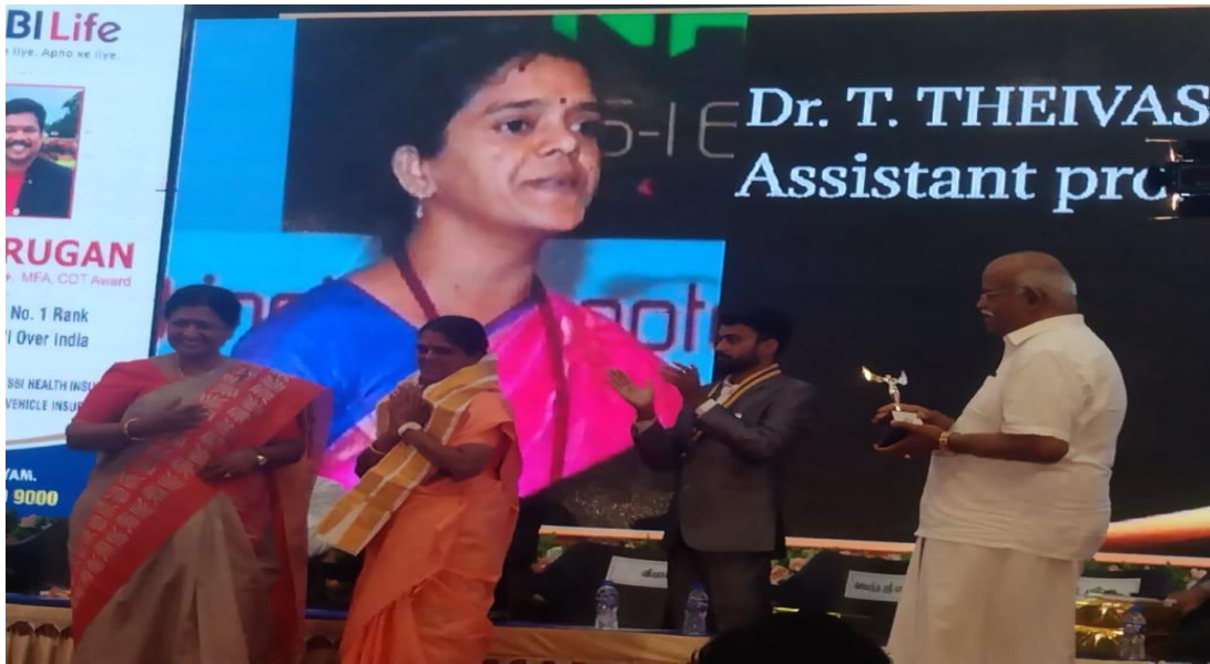
Best Women Researcher Award – Jan 2023