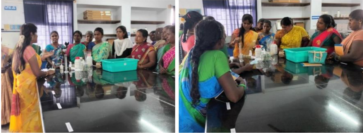
Practical session on “Microbial culture inoculation”