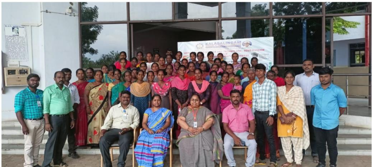
Group Photo with the Beneficiaries of Three days Training programme on “Production Of Banana And Bamboo Based Economical And Eco-Friendly Textile Products”

Various Events under DST-SEED- STI Hub link :