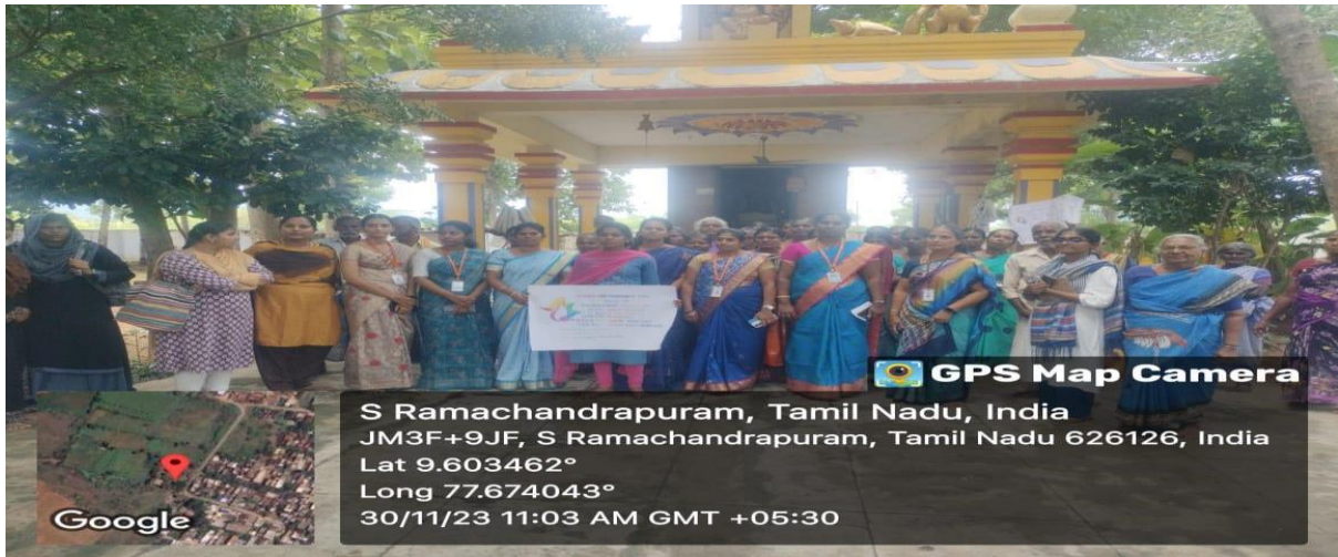
Diabetes mellitus for SHG – Ramachandrapuram Women on 2023

Various Events under DST-SEED- STI Hub for SHG nearby villages