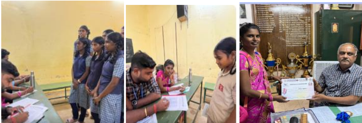
RJ HUNT 2.0 Competition - GS Hindu Higher Secondary School, Srivilliputtur Jan 2023