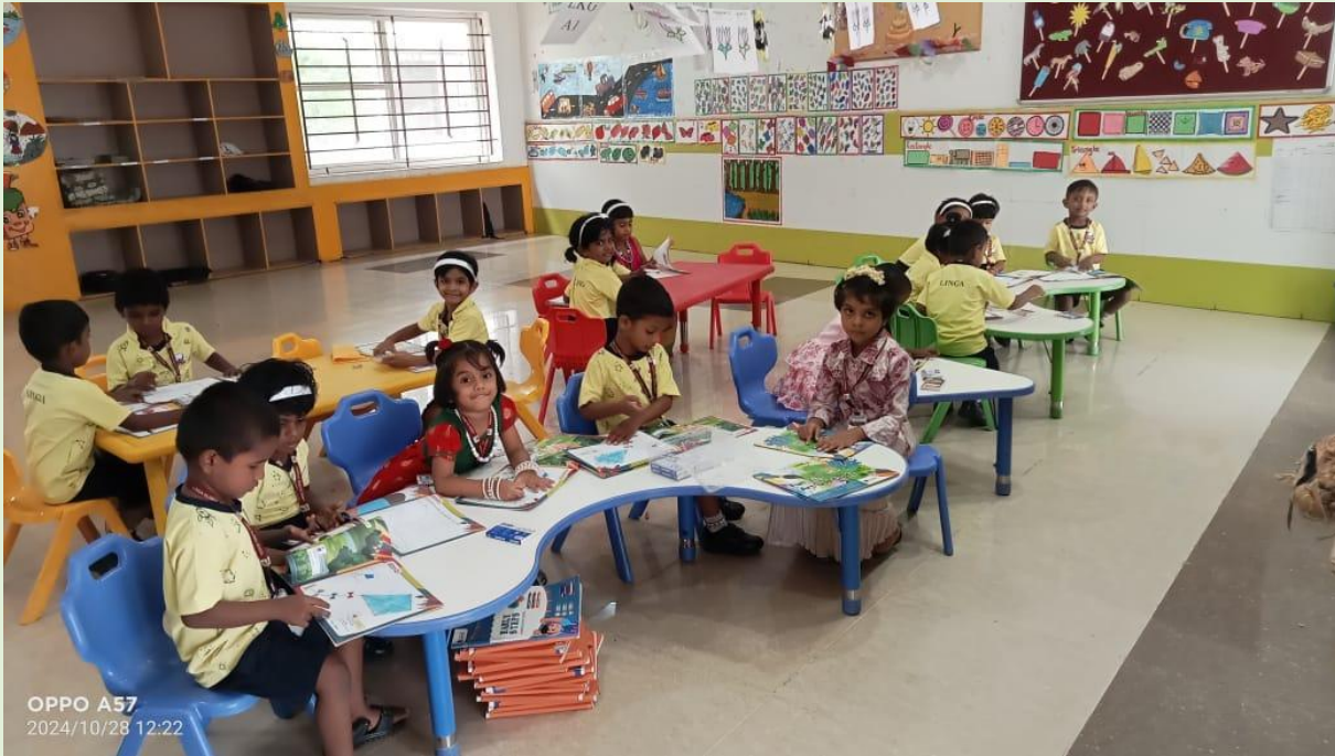
Day Care Facility for KARE faculty, staff and Students