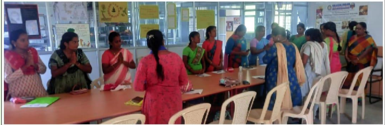
Training on Quality Cocoon Production and Making Cocoon Handy Crafts