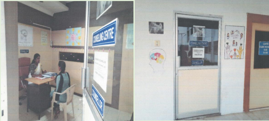
Counseling Center at KARE

All policies related with Women are available in college website : www.kalasalingam.ac.in