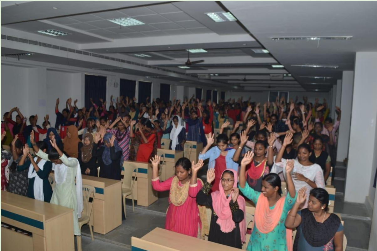
Rights of Women under Indian Law

Mentoring could enable increase in promotion of women training and professional development in support of Women Empowerment that is capable of driving a positive cultural change in the organization