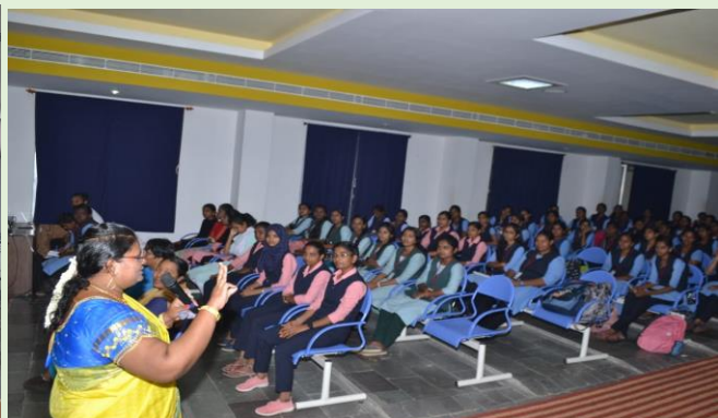
Events for girls students in KARE