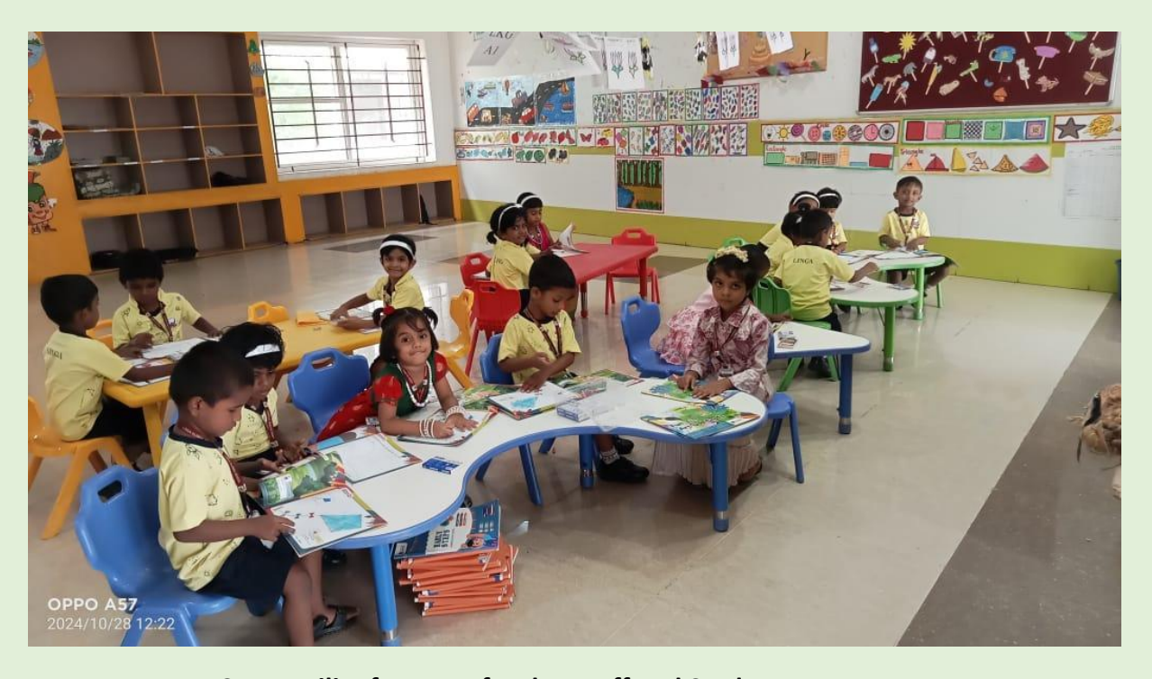
Day Care Facility for KARE faculty, staff and Students