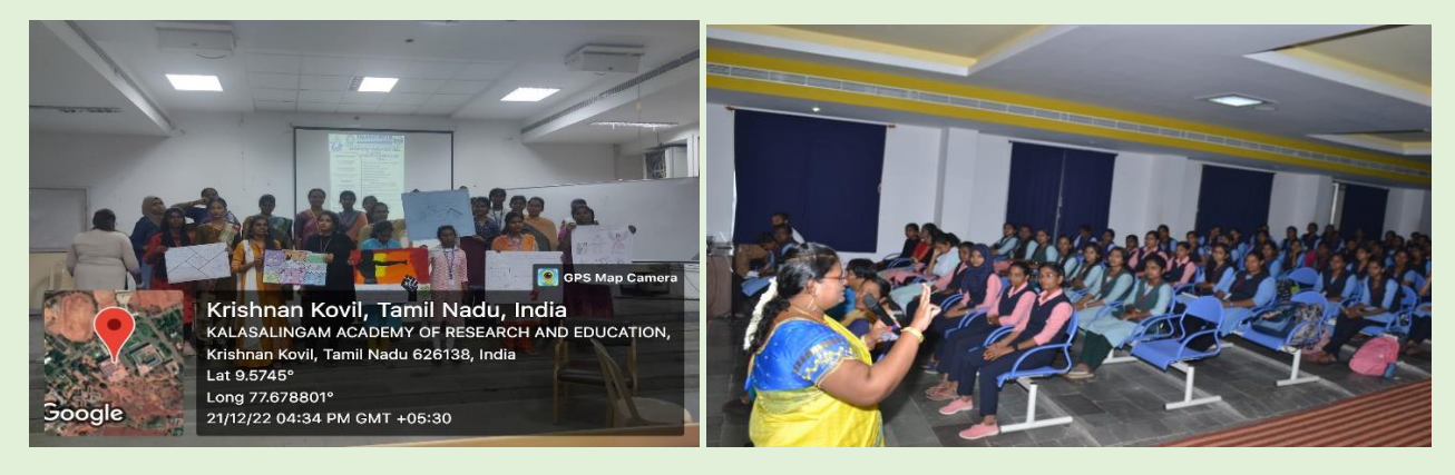
Events for girls students in KARE