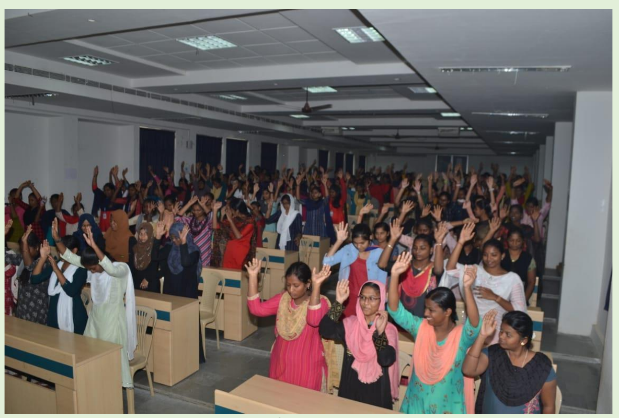
Rights of Women under Indian Law

Mentoring could enable increase in promotion of women training and professional development in support of Women Empowerment that is capable of driving a positive cultural change in the organization