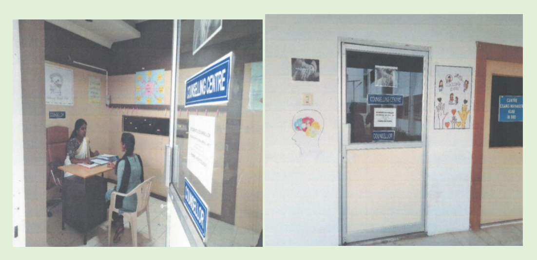
Counseling Center at KARE

All policies related with Women are available in college website : <a href="www.kalasalingam.ac.in">www.kalasalingam.ac.in</a>