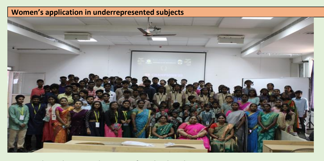
KARE conducts the outreach program for school students – Dec 2022