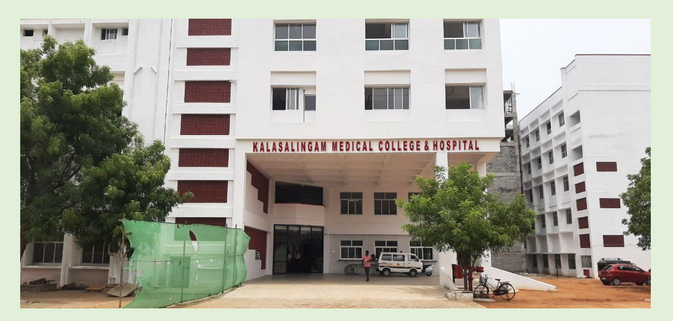
Kalasalingam Medical College and Hospital

Health infrastructure facilities for students, academics and administrative staffs' wellbeing inside the campus