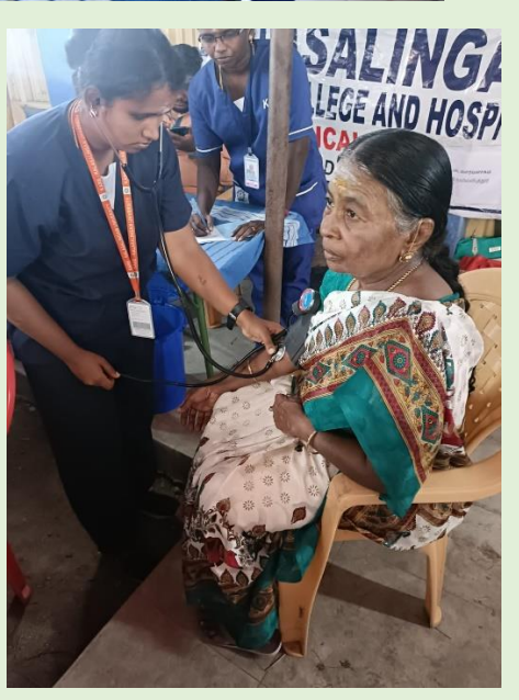
Recognition for Social Development

Kalasalingam Academy of Research and Education has garnered significant recognition from NGOs and trusts for its unwavering commitment to social development. These organizations have acknowledged the university's ongoing contributions to public health, rural development, education, gender equality, environmental sustainability, and other areas that promote positive societal change.