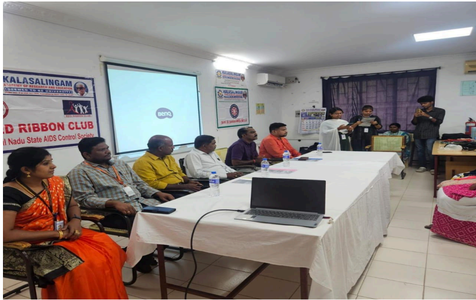
Events-Sustainable use of Land