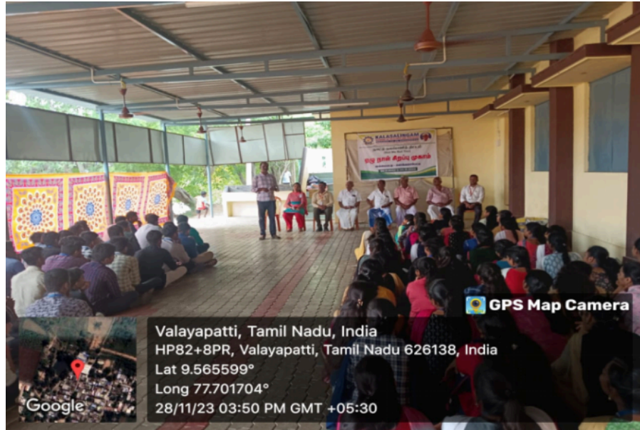
National Service Scheme (NSS) wing of KARE organized a special camp for seven days for sustainable use of land during 28th November 2023 to 04th December 2023.