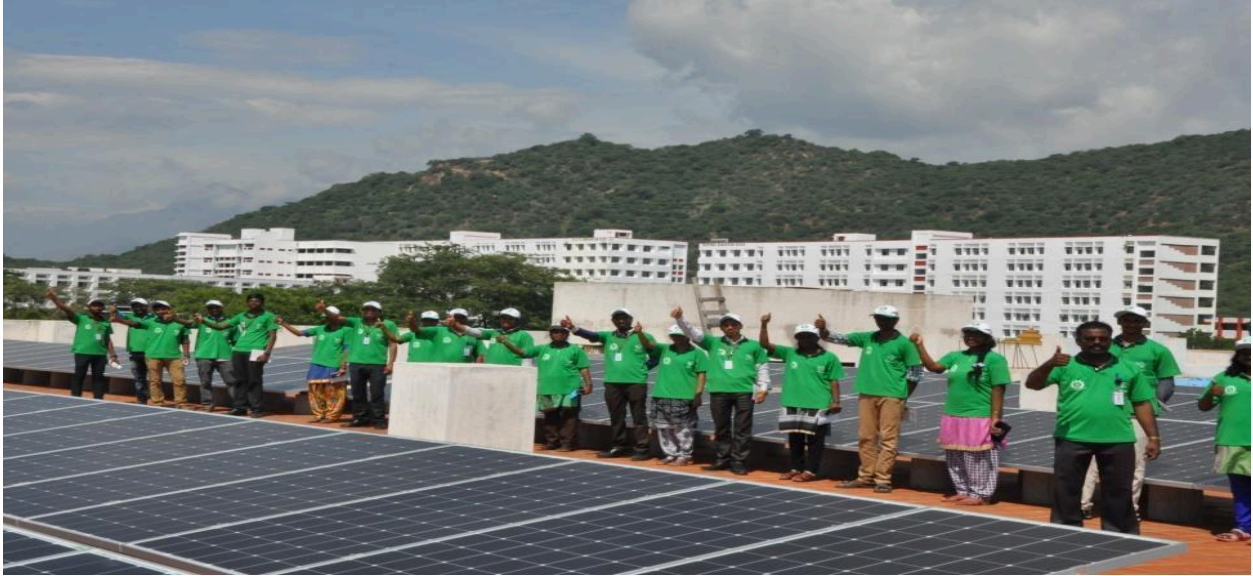
Our Green Army Volunteers monitoring the Solar Power Plant on 26.03.2024