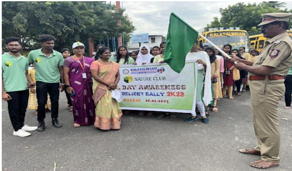
Our Nature Club took a moment to celebrate the same on 16th December 2023. An awareness rally was conducted by Nature Club, KARE at Watrap- Nature Club on 16.12.2023