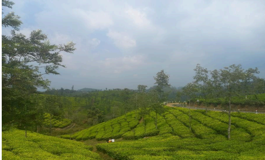
The journey was a captivating blend of learning, exploration, and creative expression- Horticulture Club on 24-02-2023