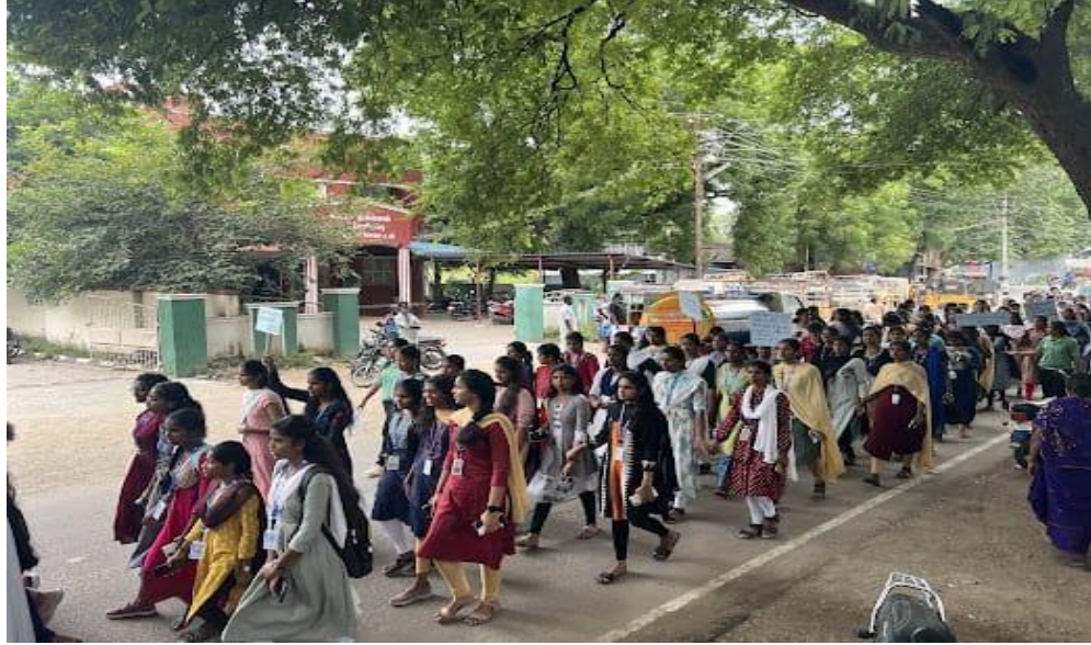
Around 300 volunteers participated in the event and they raised their voice as “Healthy soil, healthy planet!”, “Protect soil, nurture life!”, “Preserve soil, preserve life!” and “Nourish soil, nourish future!”- Environment monitoring Club on 16.12.2023