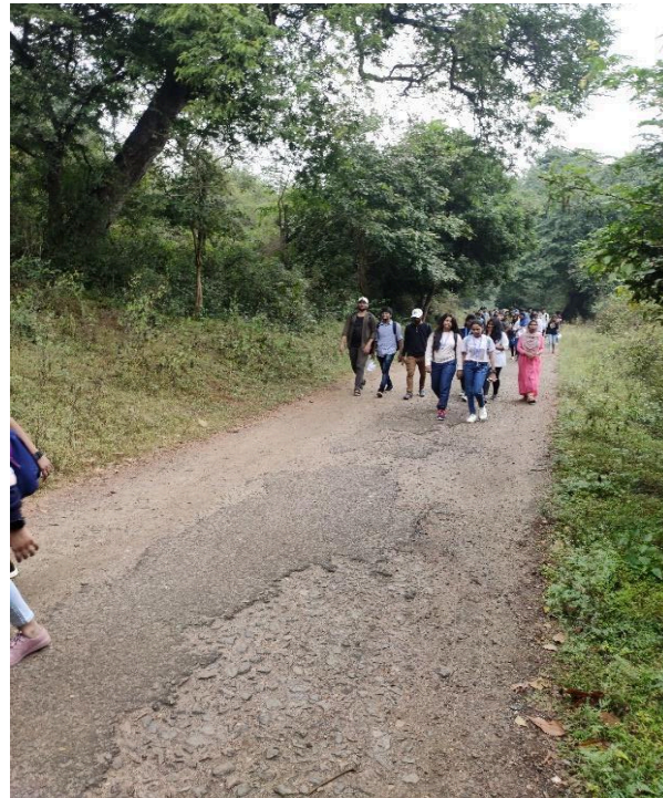
Inspection survey and analysis of energy- Energy Audit Club on 23.03.2024