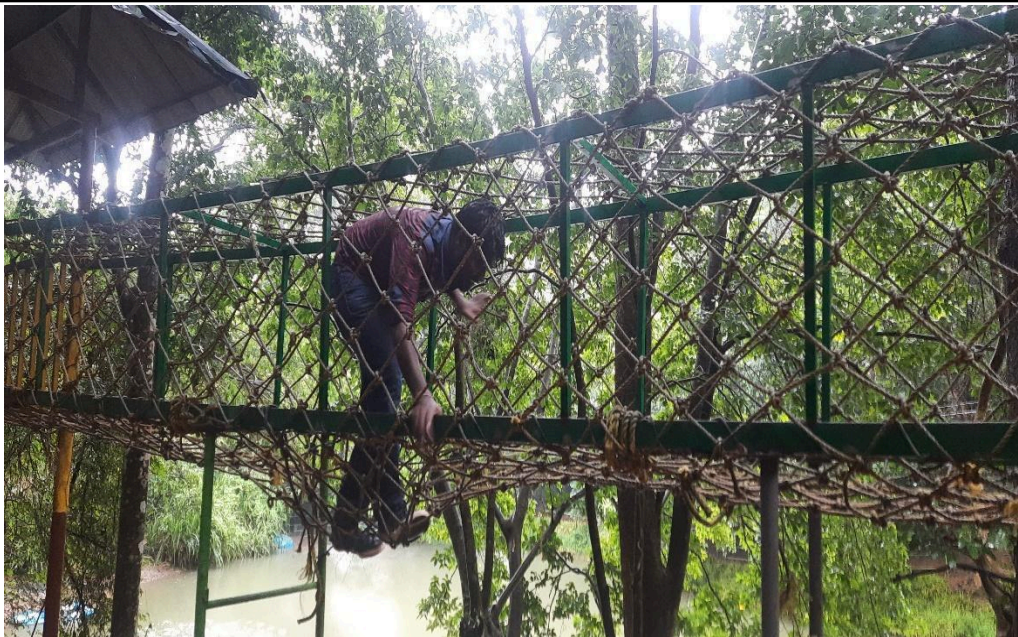
Engaged in adventurous activities & gardening- Agriculture Club on 23.03.2024