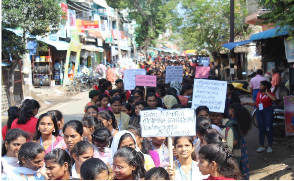
Awareness camp for land Protection