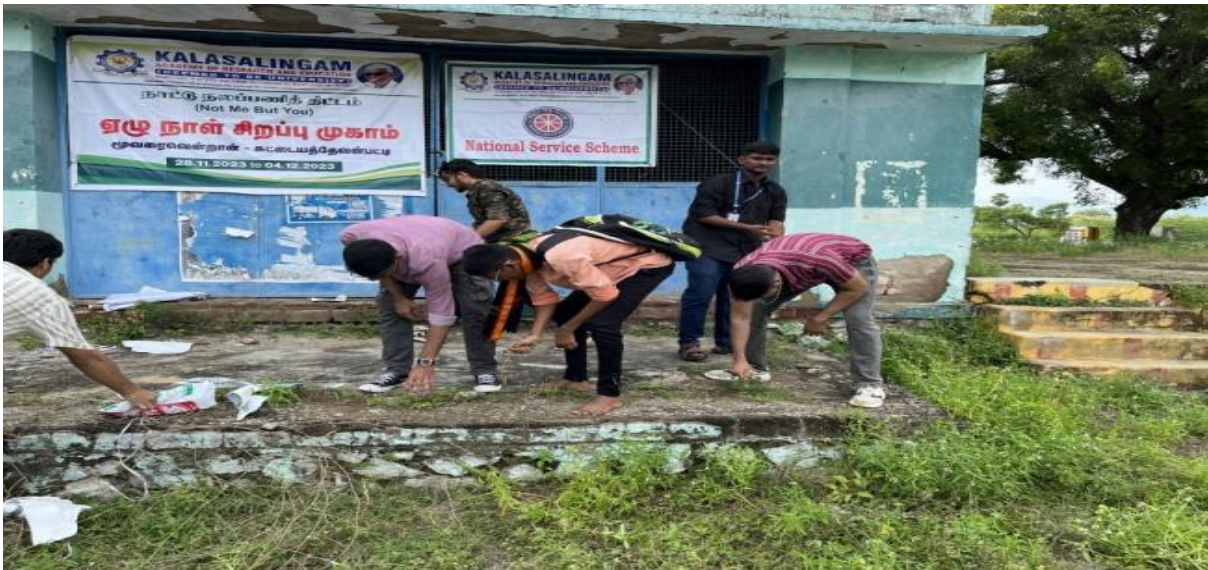
Unnat Bharath Abhiyan (Clean India Campaign) About 500 students participated in the camp were organized on 28.11.2023 to 04.12.2023