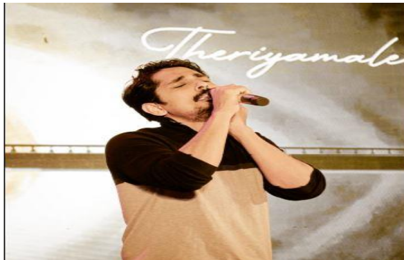
Guest Shri. Siddharth, Actor