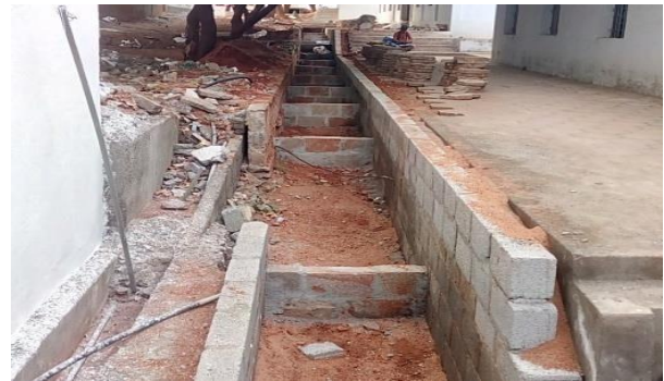
Construction of rainwater harvesting facility