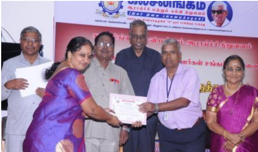
Mahakavi Bharathi's Birthday Function by Tamil Mandram