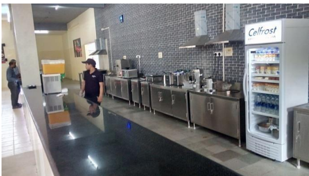
A view of canteen

Sodexo is a French food service and facilities management company headquartered in Paris, France. Sodexo is one of the world's largest multinational corporations, with 4,20,000 employees and is present on 34,000 sites in 80 countries. A contract was signed with Sodexo to launch its catering arm in KARE from the 2019-2020 academic year. Sodexo committed to provide hygienic and quality multi-cuisine food services to students. In 2019-2020, Sodexo launched its catering in KARE, Krishnankoil.