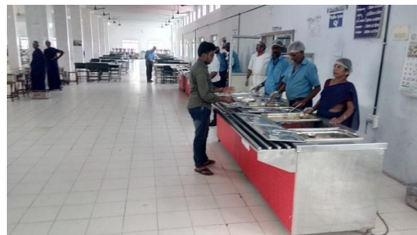
A view of hostel dining hall