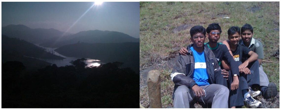
Scene of Meghamalai Spot in the Morning

Nature club arranged a Trekking camp in Meghamalai region from 22.1.2010 to 25.1.2010. Four members from Nature Club participated enthusiastically in the stay camp. The Forest Guardsguidedthe crew and gave information about rescuing the wild life animals, forest fire and conservation of forest. Meghamalai is one of the beautiful and amazing places for trekking that lies in the Western Ghats in the Southern region.