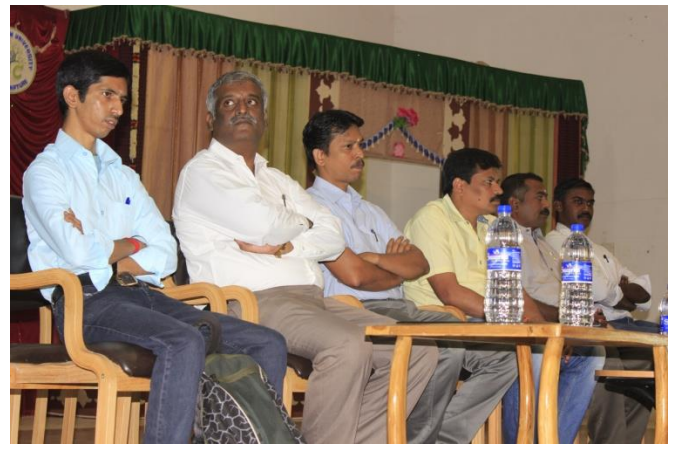
welcoming of chief guest by vice chancellor