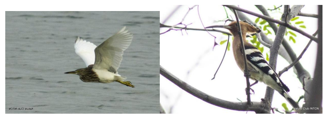
Indian Pond Heron