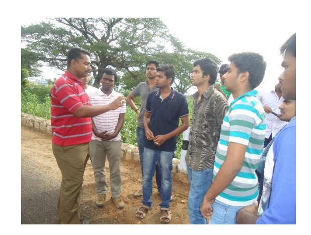
Cultivable land changes to building plots