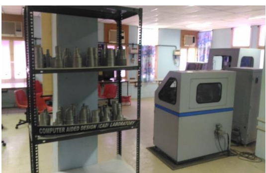
CNC Milling Machine