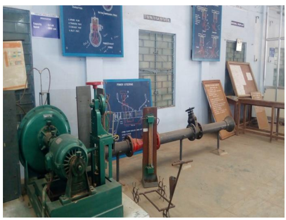
2 Stage Reciprocating Air Compressor