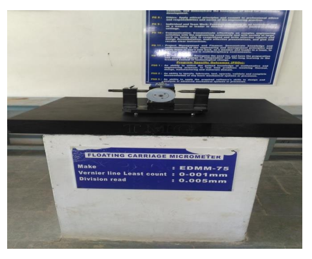
Floating Carriage Micrometer