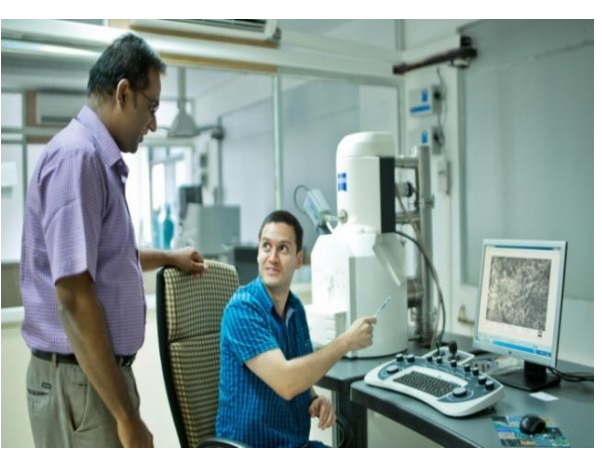
Stereo Zoom Trinocular Microscope