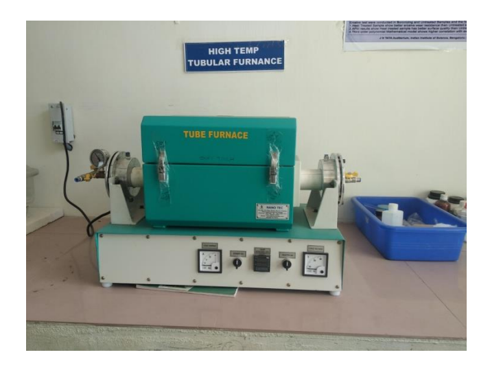
High Temperature Tubular furnace (Temp: up to 1200°C, Tolerance: \pm 1 °C)