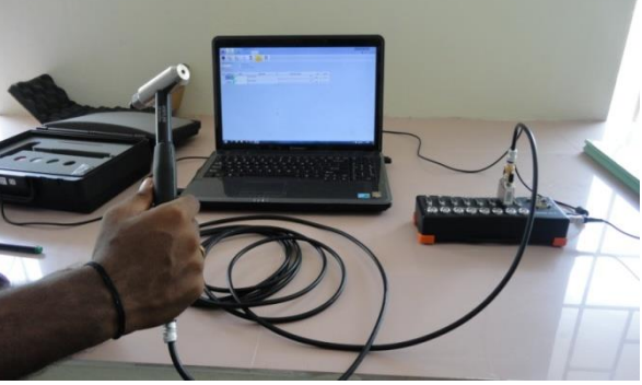
Tri axial accelerometer