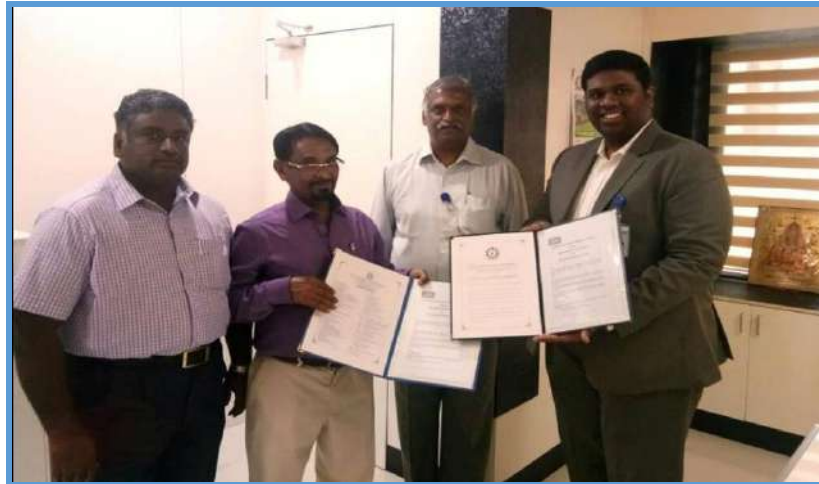
KARE signing of MoU with Debre Berhan University, Ethiopia